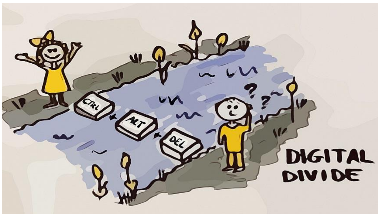
Illustration by Zilvinas Mazeikis, from the Symposium "Connecting the dots: young people, social inclusion and digitalisation"

The topic of digitalisation has been one of the key priorities for the European institutions over the last years, as well as the topic of great significance for the youth field, including policy makers, youth researchers and youth practitioners. The effects of COVID-19 pandemic on the youth sector have highlighted the need to look at the existing practices that link digitalisation to the different aspects that are relevant to and for young people . Across Europe, there is an increasing interest in the opportunities digitalisation offers, but also for the needs and interests of young people that are still uncovered by the existent digital tools and platforms. The debate also includes a discussion of the challenges that the state and non-state actors face in responding to young people's needs in the online world.