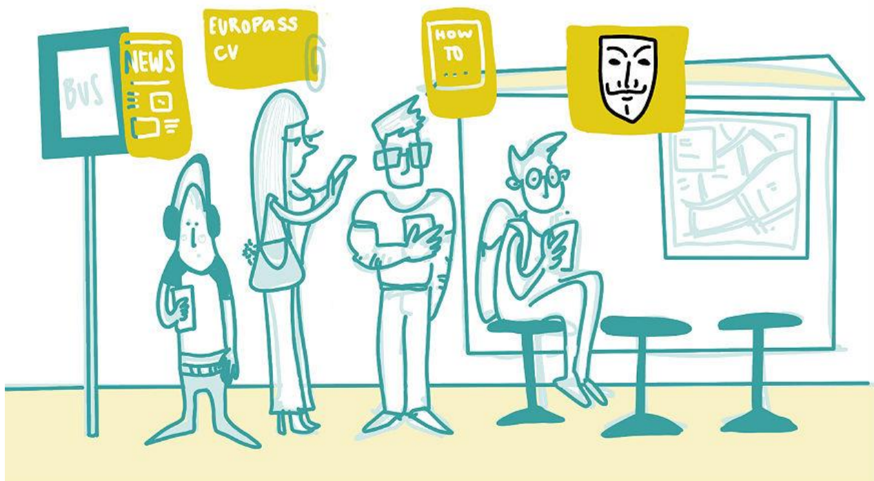
Illustration by Vanda Kovacs, Coyote, Issue 27, 2018

Furthermore, based on pre-crisis data, when it comes to the use of technology and the Internet, young people have shown a clear preference for entertainment activities - 93% and participation in social networks - 86%. On the other hand, only 60% of young people have used it for seeking health information, 31% searching or applying for a job, 25% to communicate with instructors or students through educational platforms and just 13% to take part in online consultations or voting 2 .