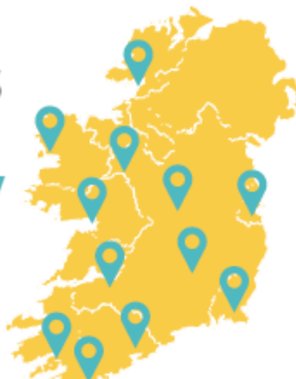
Extent of Volunteering and Paid Employment in the Youth Work Sector in Ireland - 2012