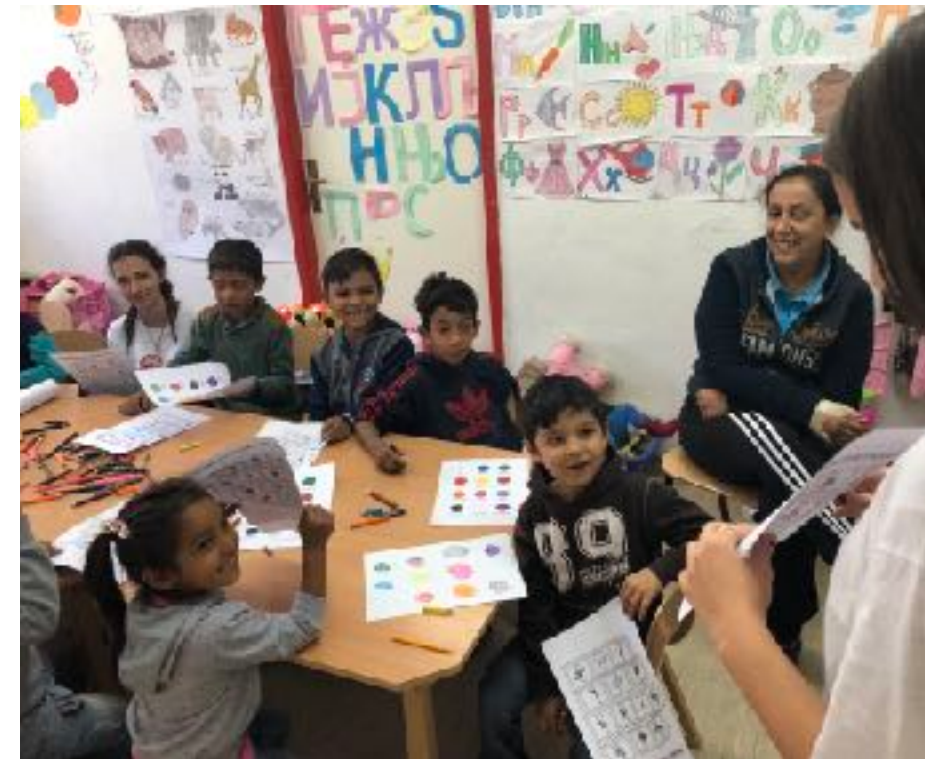
NOVA Service Learning Program - my experience in the formal educational system