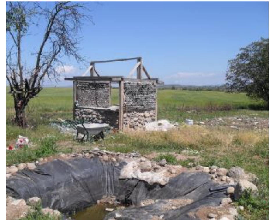
creACTive youth center - established 2009, supports creativity and active citizenship of young people, first organic farm