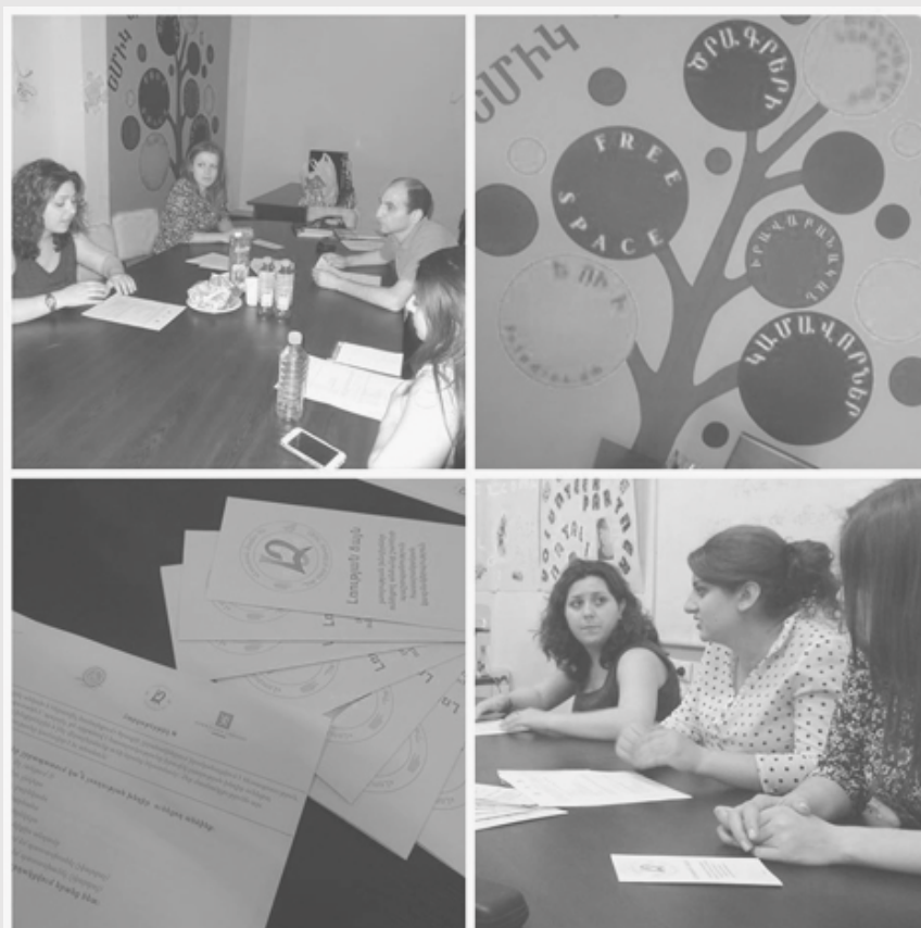
Sociologists processing data in Youth Studies Intitute