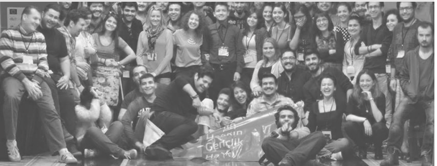
Youth Organisations Forum