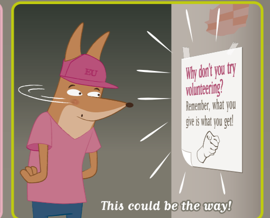
This could be the way!