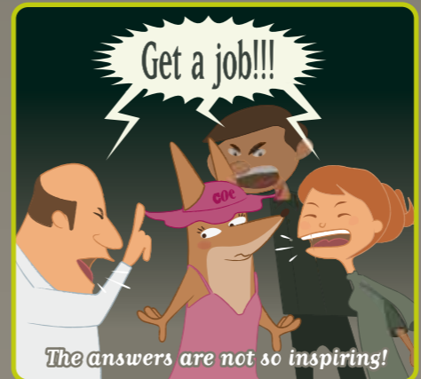
The answers are not so inspiring!