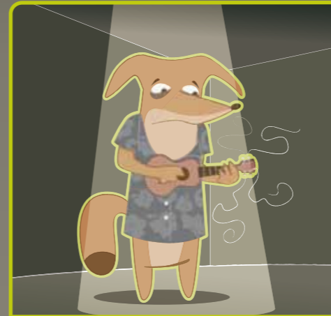
Depression strikes Spiffy once again...