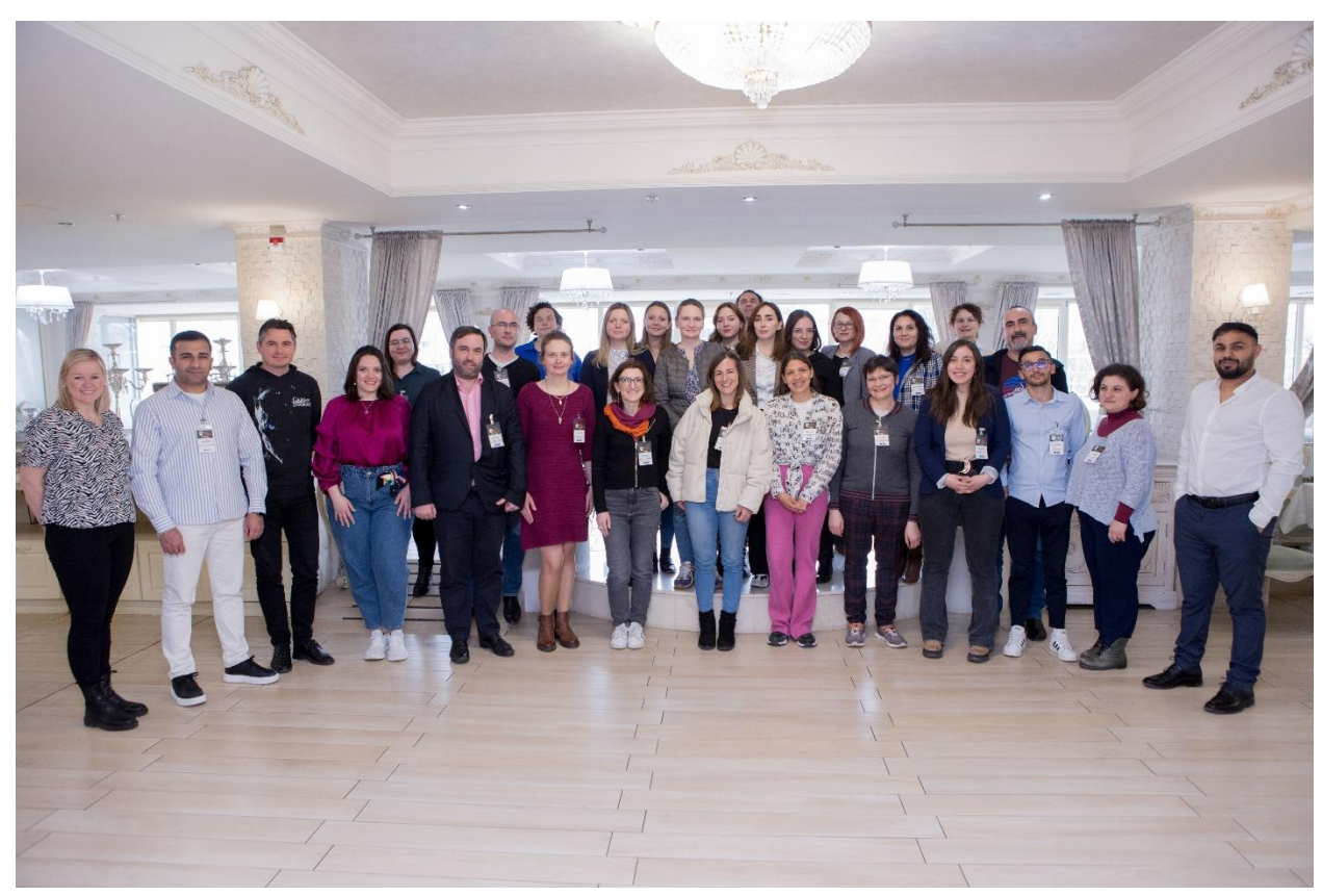
Figure 4. Members of national delegations, the Youth Partnership representatives and mentors.

Given the project is still actively in progress, this report does not provide any summary or conclusions at this time. Rather, it invites the reader to stay tuned as the initiative continues unfolding. For now, we look forward to the delegations and mentors driving towards the project objectives. The story is still being written, so stay tuned!