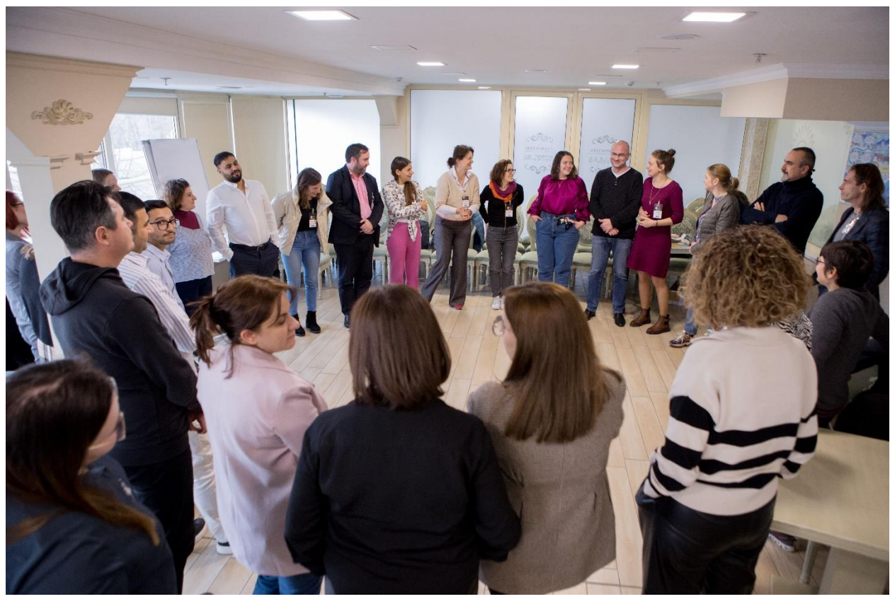
Figure 2. Residential seminar participants at the start of the event.